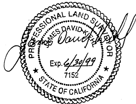
EXHIBIT A ( 1 of 2 ) (to Deed)