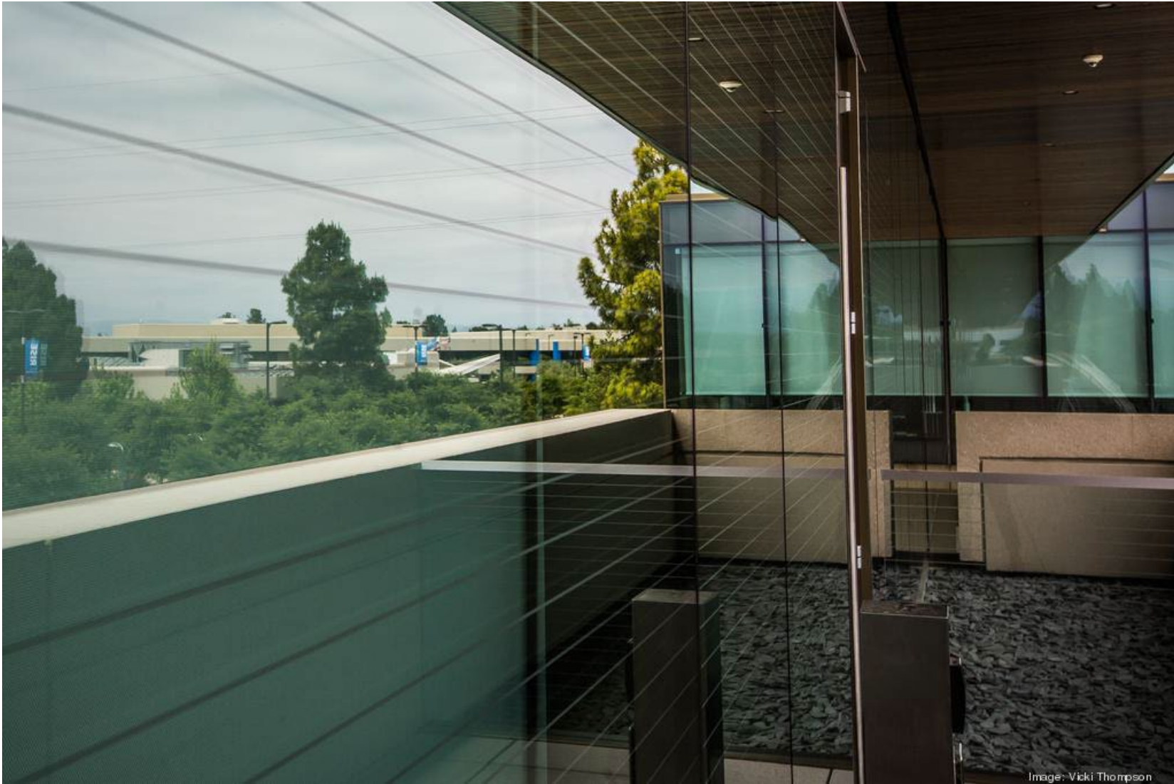
Google Campus in Mountain View