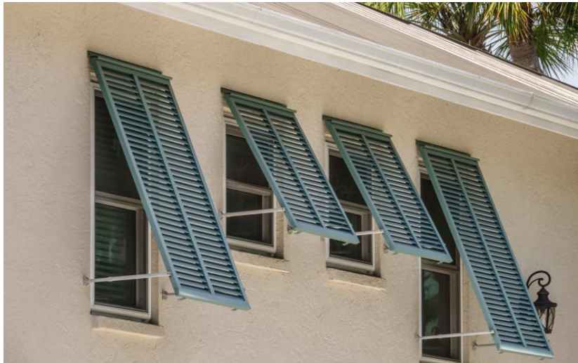
Exterior Shutter sample