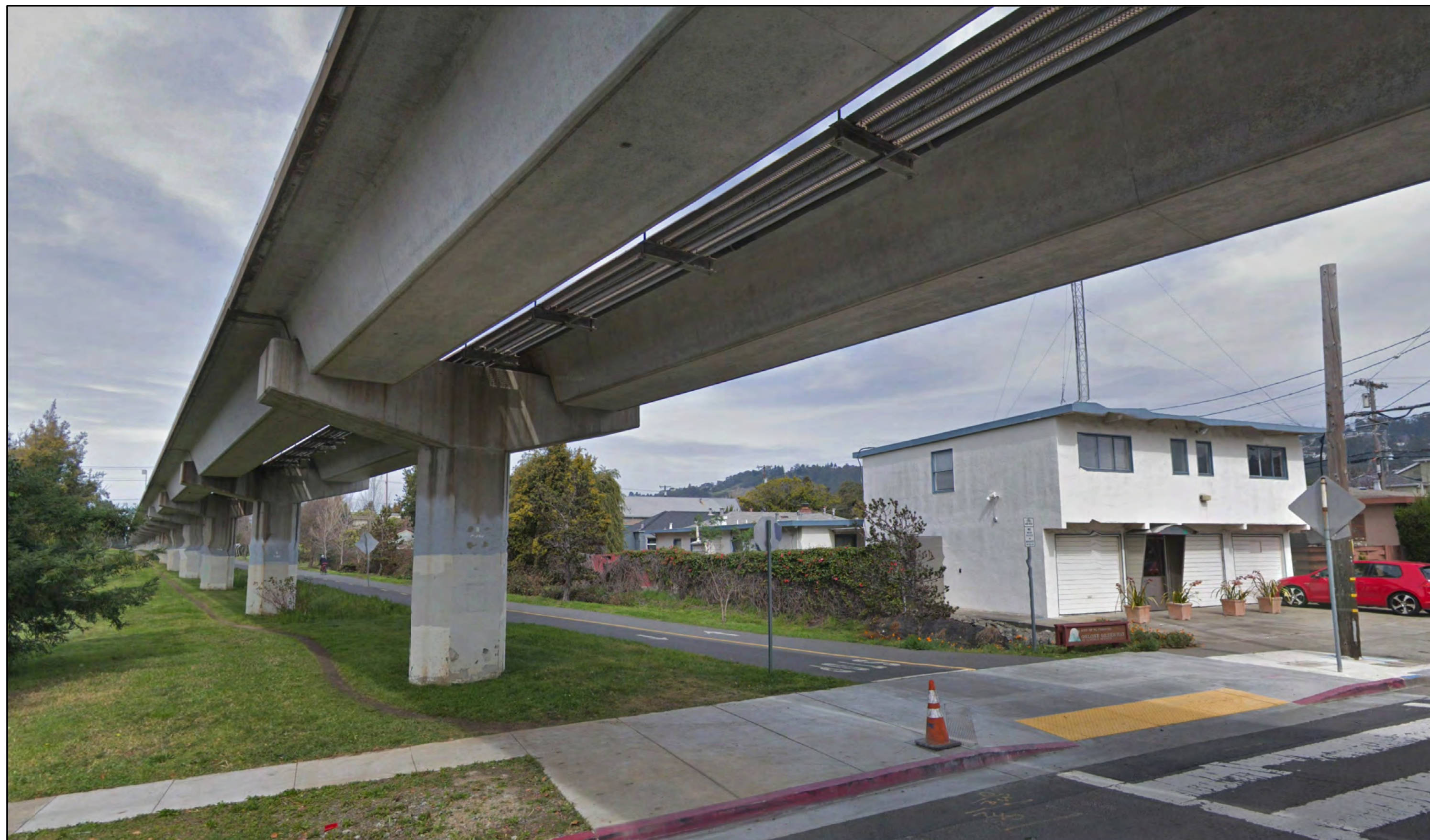
BART Viaduct, El Cerrito, CA