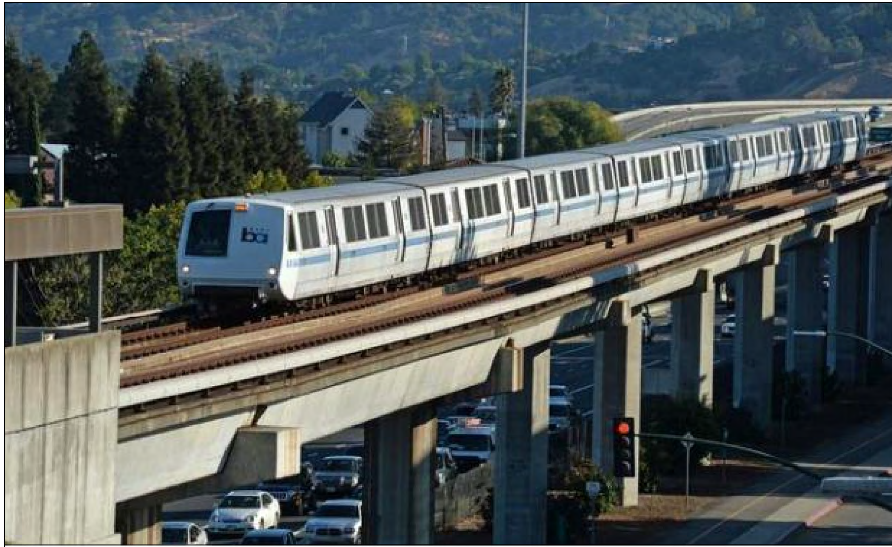
Walnut Creek BART Station