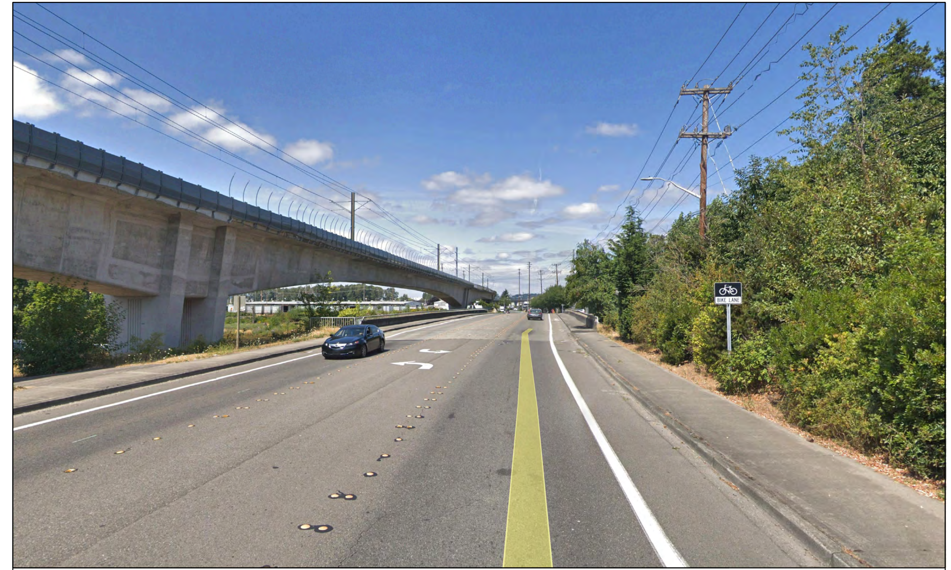
Link Light Rail, East Marginal Way, Seattle, WA