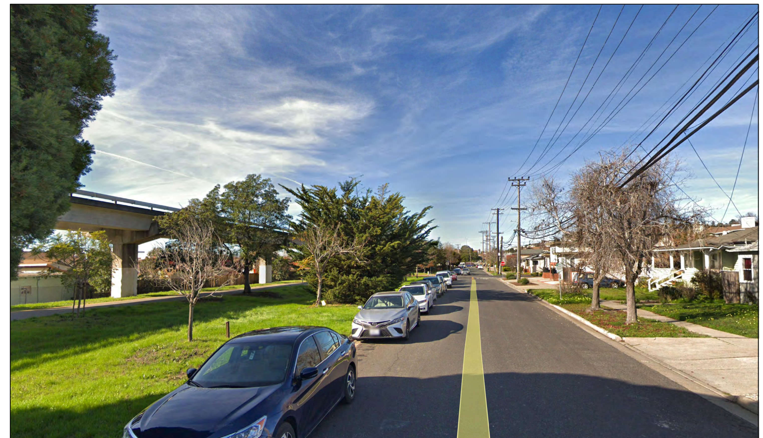
BART Viaduct at distance, El Cerrito, CA

PRELIMINARY FOR DISCUSSION PURPOSES ONLY