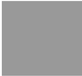
ELECTRICAL BUILDING COLOR ANSI 70 GRAY #5049

Electrical building – The electrical building will be a pre-fabricated building that houses motor control centers (MCCs) and variable frequency drives (VFDs) as well as a small control room for SCADA equipment. The building is located west of the main structure and is 80 ft long by 20 ft wide with a height of 12.5 ft. The building is a prefabricated unit painted ANSI 70 Gray #5049.