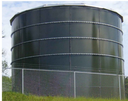
RO PERMEATE TANK COLOR FOREST GREEN

Chainlink security fence – An 8 feet high galvanized steel chain-link to meet RWQCP security specifications. Additionally, perimeter fencing solutions are developed to meet the project criteria of aesthetically screening the local AWPS from exterior public view.