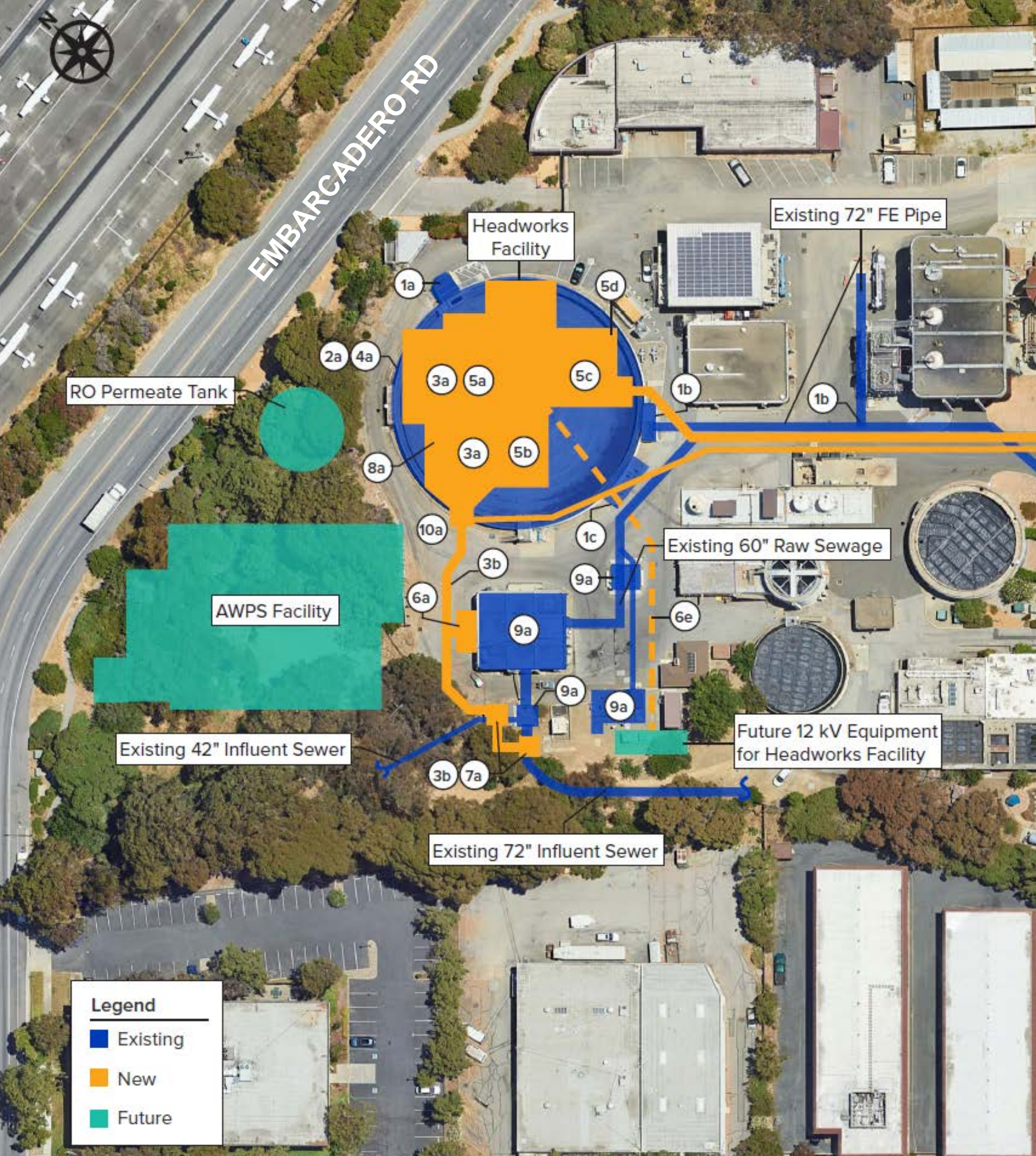
FIGURE 2. PROPOSED FOOTPRINT OF NEW HEADWORKS FACILITY (ORANGE)