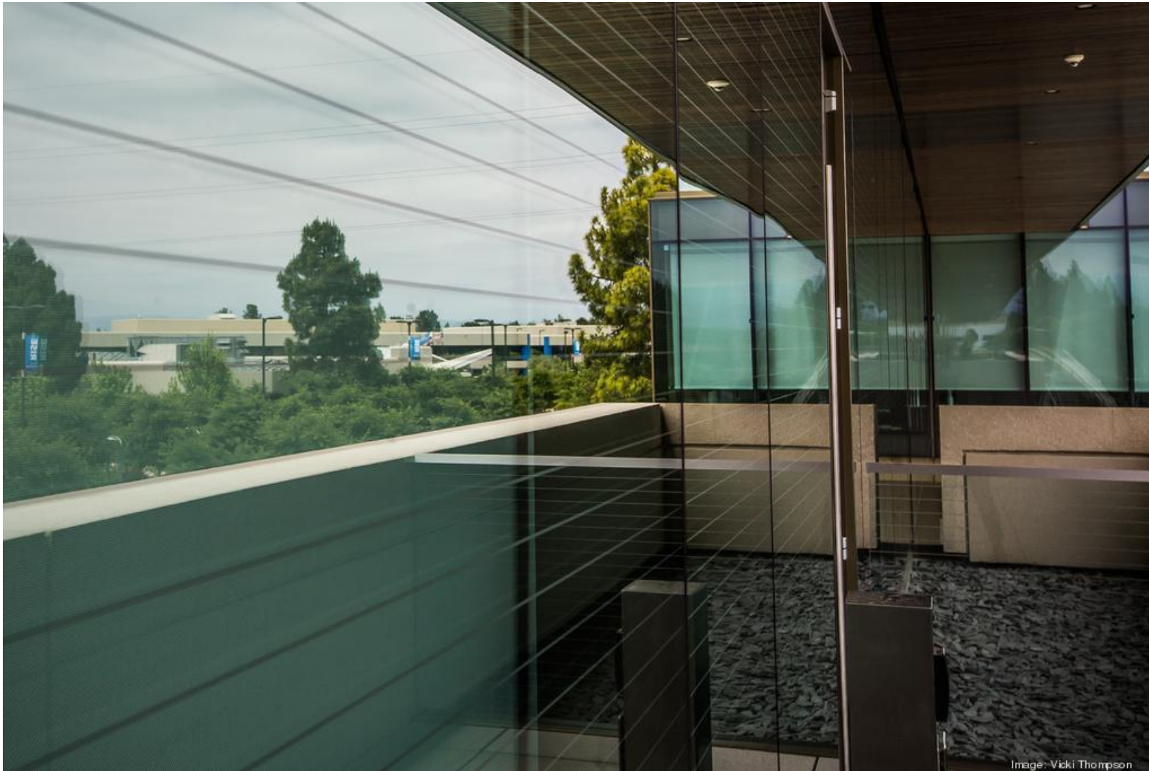
Google Campus in Mountain View