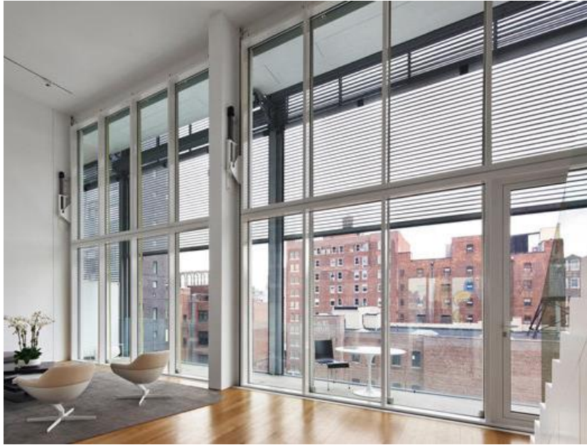
Metal Shutter House, New York City