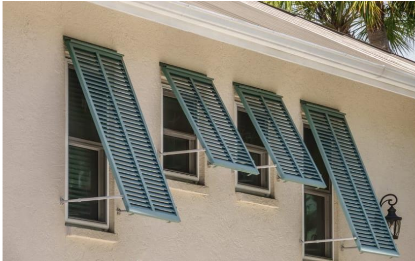
Exterior Shutter sample