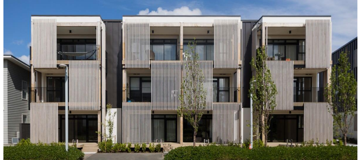
The Grounds, Hobsonville Point, NZ