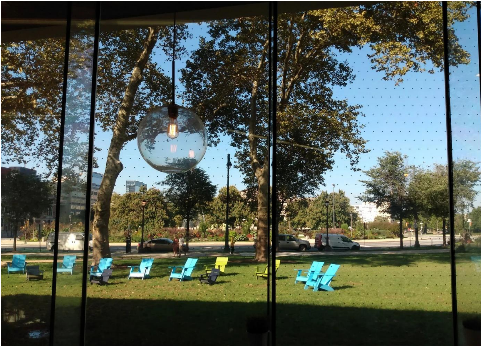
Sister Cities Café, Philadelphia