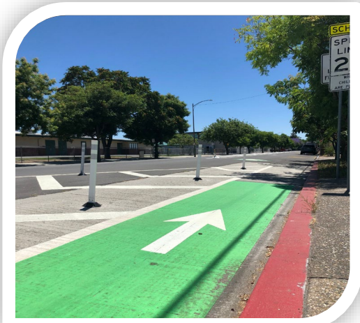
Class IV Bike Way