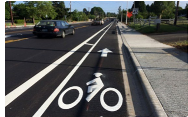
Class II Bike Lane

Construction began in November 2023 and is anticipated to complete in fall 2025