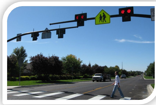
Pedestrian Hybrid Beacon