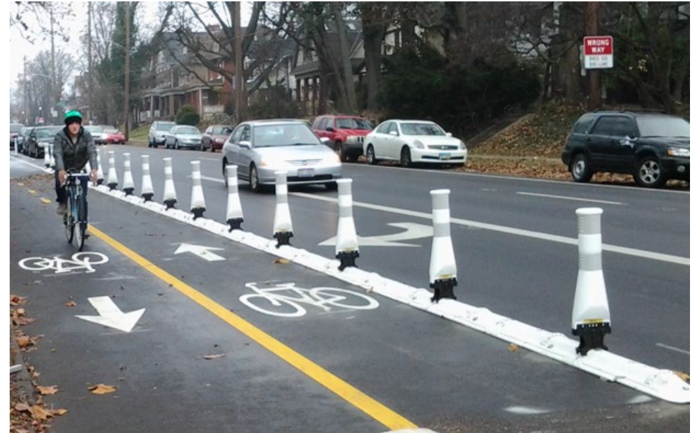
Example separated bikeway.