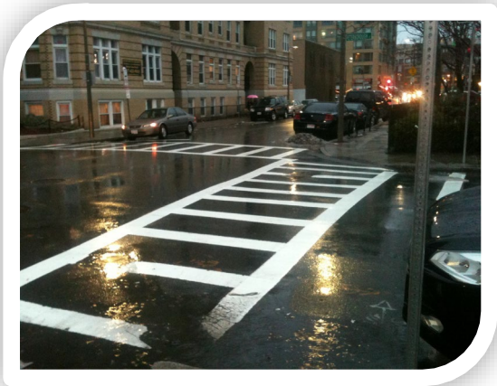
High Visibility Crosswalk