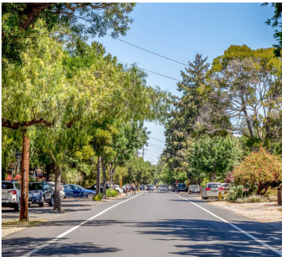
Barron Park neighborhood

Through its design features, Buena Vista Commons will bring energy efficiency, community cohesion, and curb appeal. It will also use materials that are intended to maintain well over time. For energy efficiency, Buena Vista Commons will be all-electric, use natural flooring, use Energy Star appliances, have bicycle parking, and will be setup to accommodate electric vehicle charging. For the resident community, it will have a barbecue area, teen room, community room, and resident services offices. And compared to the built structures at Buena Vista Mobile Home Park today, the apartment will have playful angles, fresh colors, and new trees that will make it attractive to passers-by in the Palo Alto community.