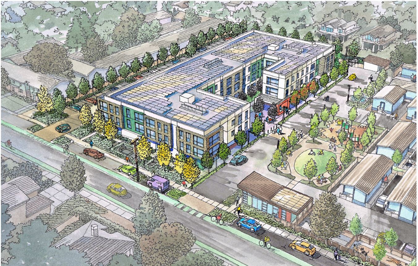
Aerial illustration of Buena Vista Commons- the proposed 3-story apartment building

Buena Vista Commons will be deed-restricted as 100% affordable housing. The apartment will serve existing renters who live at the Buena Vista Mobile Home Park, and it will increase affordable housing opportunities to more families in Palo Alto. Among the current resident population of the Park, a 2023 income recertification found that 90% of all current households are low-income (below 80% AMI and over half of households are very low-income (below 50% AMI). The average affordability level for each home at Buena Vista Commons is expected to be below 42% of AMI. The proposed project preserves affordable housing among the Park community and helps meet the larger community need for more affordable housing in Palo Alto.