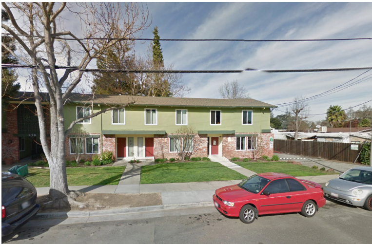
Adjacent building: Oak Manor Townhouses by Alta Housing