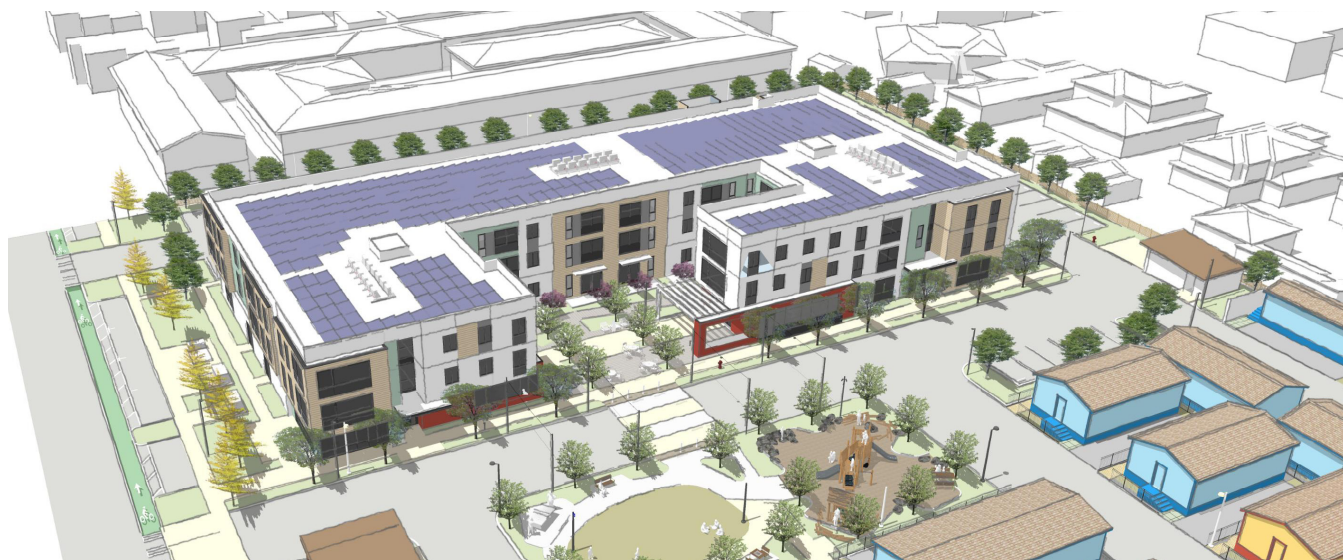
Concept view of Buena Vista Commons

In early 2019, SCCHA began working with Van Meter Williams Pollack LLP (VMWP) on the redesign and renovation of the Buena Vista Mobile Home Park. Through a series of evolving design challenges and iterations, the design program for the redevelopment ultimately landed on a hybrid model- including a new apartment building and a mobile home park as well as infrastructure upgrades and new amenities.