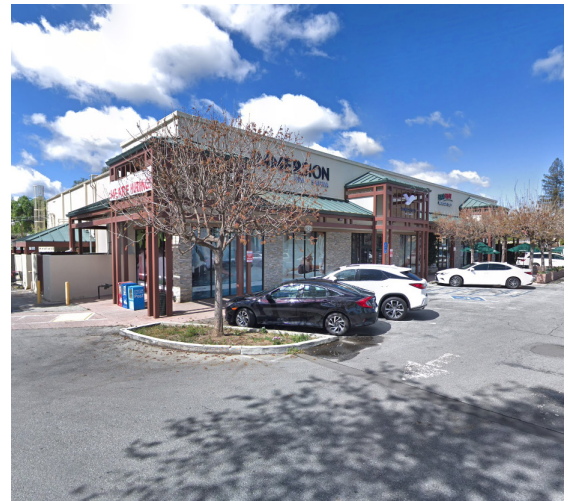
Adjacent commercial building along El Camino Real