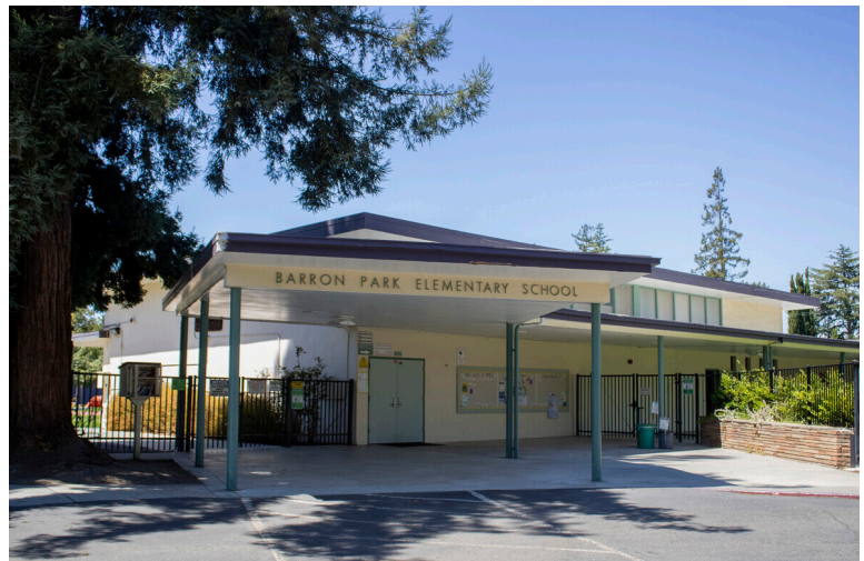
Barron Park Elementary School