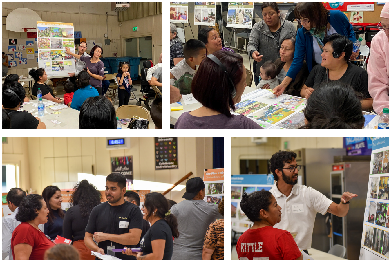
Photos from various townhalls

Phase 3 is Post-Entitlements and Construction Outreach. This phase has not yet begun, but it is part of ongoing engagement where we will continue to provide information on the development process to impacted households, inform leaders and elected officials about the development timeline, and be available for community stakeholder input.