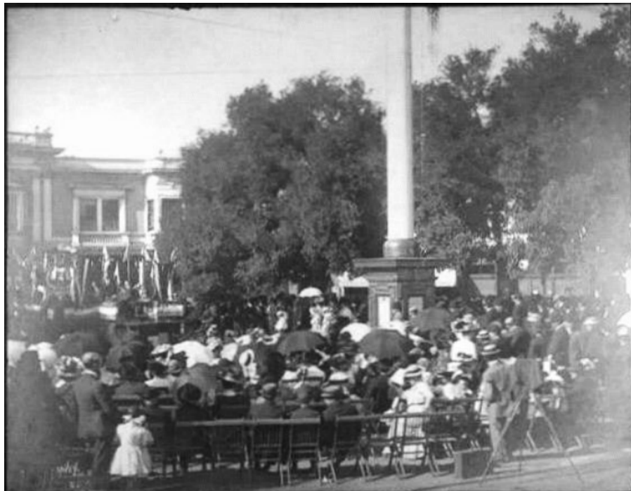
Flagpole Dedication Day 10/26/1908